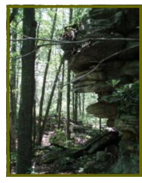
View along Splash Dam South Trail